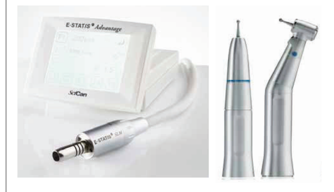
Figure 5. Electric handpiece unit and attachment examples

Any number of attachments with various gearing combinations will connect onto an electric motor. The most commonly used attachment for operative dentistry is a 1:5 step-up referred to as a "high speed" attachment. Most electric motors operate at 40,000 rpm; adding a 1:5 speedincreasing attachment provides 200,000 rpm at the bur. This speed remains constant no matter how aggressively the clinician is cutting, and the advantage is much faster preparation time. There is a learning curve associated with mastering this increased power. Electric attachments are generally universal, meaning that any brand will work with any motor. One exception is the new Comfort Drive<sup>®</sup> by Kavo, a more compact design.