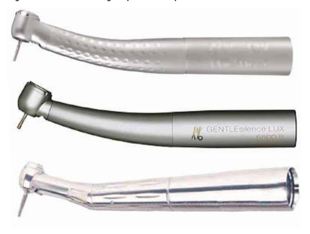
Figure 4. Air-driven high-speed handpieces

Water Delivery: All high-speed handpieces incorporate a water spray as a coolant; the latest innovation is a multiport spray emanating from the face of the handpiece. This provides even distribution of coolant water over the entire surface of the tooth and prevents the water spray from being blocked when cutting is performed on the distal surface of a tooth.