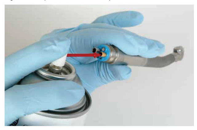
Figure 15. Proper lubrication of handpiece

Air-Driven Low-Speed Motors and Attachments