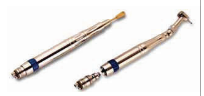
Figure 16. Low-speed attachments

It is very important to take latch angles apart for proper lubrication. If you are processing angles routinely, at least once a day unscrew the head from the sheath and remove the transmission gear for cleaning and oiling (try doing this first thing in the morning as part of the opening routine). Apply a drop of oil under each gear on the transmission gear as well as in the center hole. Apply several drops of oil to the exposed cartridge while the transmission gear is removed.